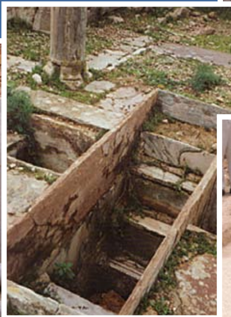
ABOVE: Baptistry at Bulla Regia