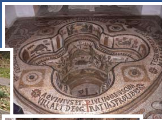
TOP Right: Baptistry at Bardo Museum in Carthage, Tunisia